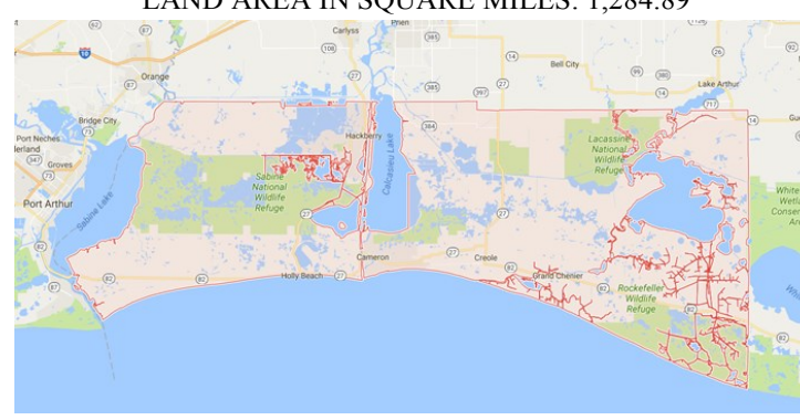
CAMERON PARISH MAP